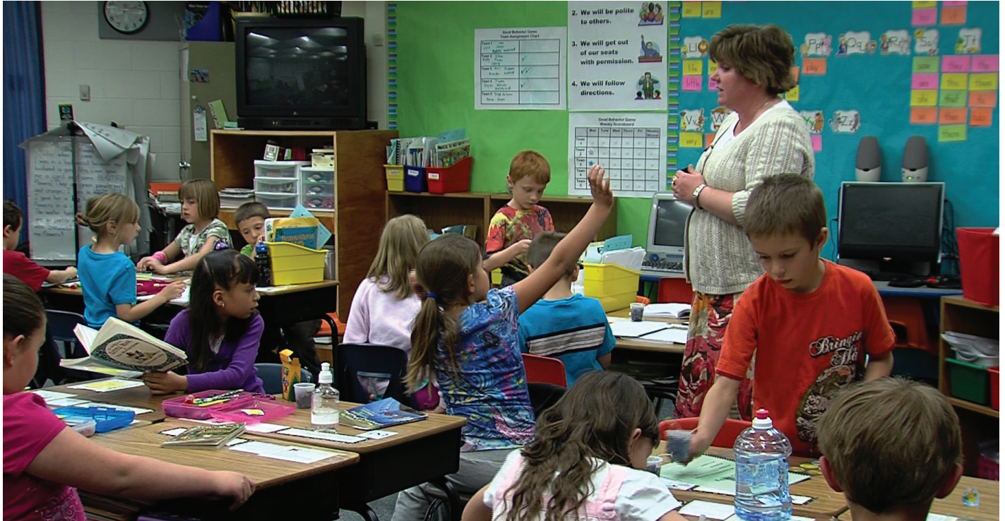
A classroom playing the Good Behavior Game in Denver.

some of these problems later in the life course;